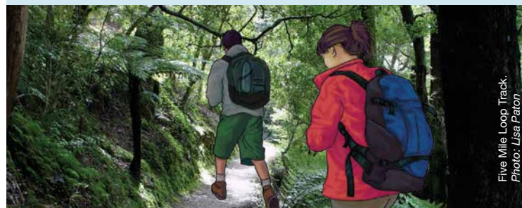
Five Mile Loop Track.

For more information and to book, visit booking.doc.govt.nz or contact the Wellington Visitor Centre by phone: 04 384 7770 or email: wellingtonvc@doc.govt.nz .