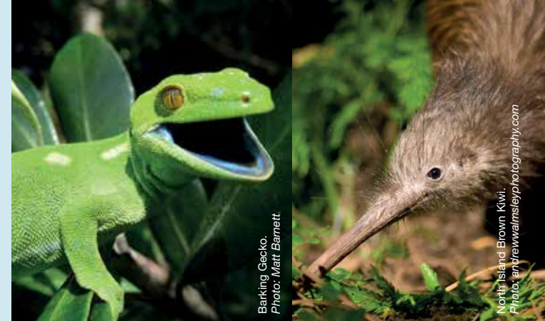
Barking Gecko.