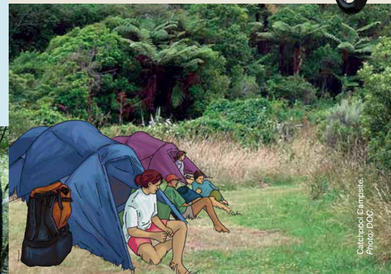
Catchpool Campsite.

For information and hunting permits contact the Wellington Visitor Centre on 04 384 7770, wellingtonvc@doc.govt.nz or visit huntingpermits.doc.govt.nz .