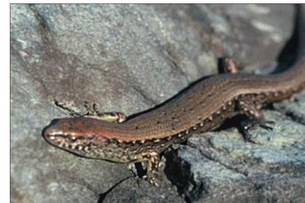
Copper skink.

Turakirae Head Scientific Reserve also provides habitat for a variety of native birds and reptiles. Banded dotterel, caspian tern and variable oystercatcher are among the bird species that may be observed. Copper skink, spotted skink, common skink and common gecko are all present within the reserve.