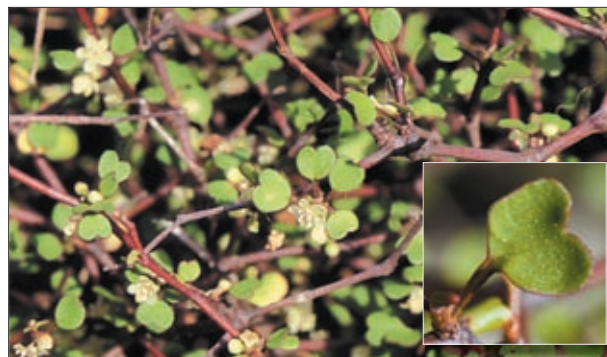
Shrubby tororaro, Muehlenbeckia astonii.

A nationally threatened plant, the shrubby tororaro, Muehlenbeckia astonii , occurs within the reserve. A new population of shrubby tororaro was established at Turakirae Head in 1998 as part of a programme to avert the extinction of the species.