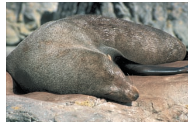
NZ fur seal.

This colony began in 1950 and has steadily increased since then to become the largest haulout on the south Wellington coast.